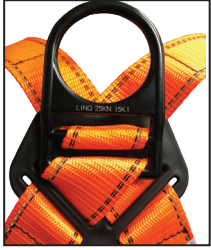
DORSAL D RING